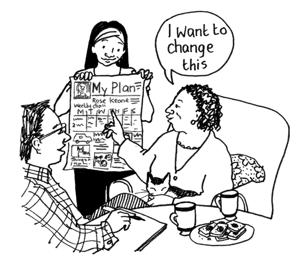
It's gone well. Let's talk about what's next.