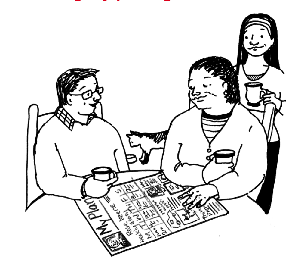
Yes - it looks like a good plan.