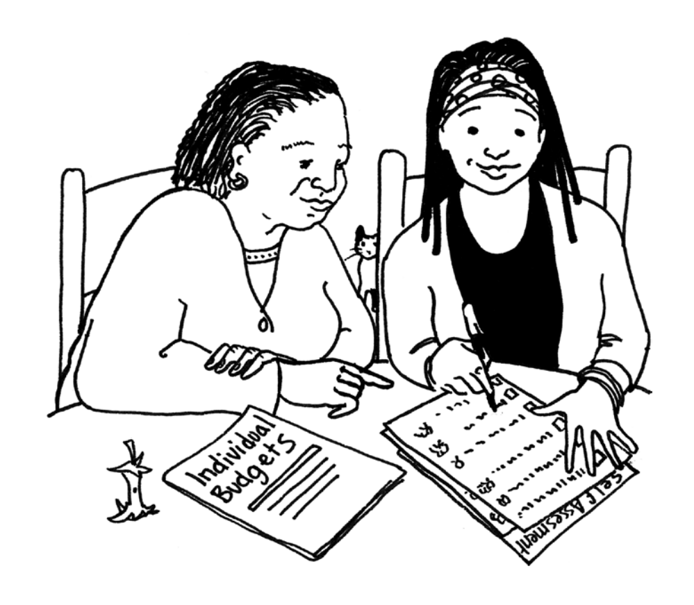
So it looks like I can get £15,000.