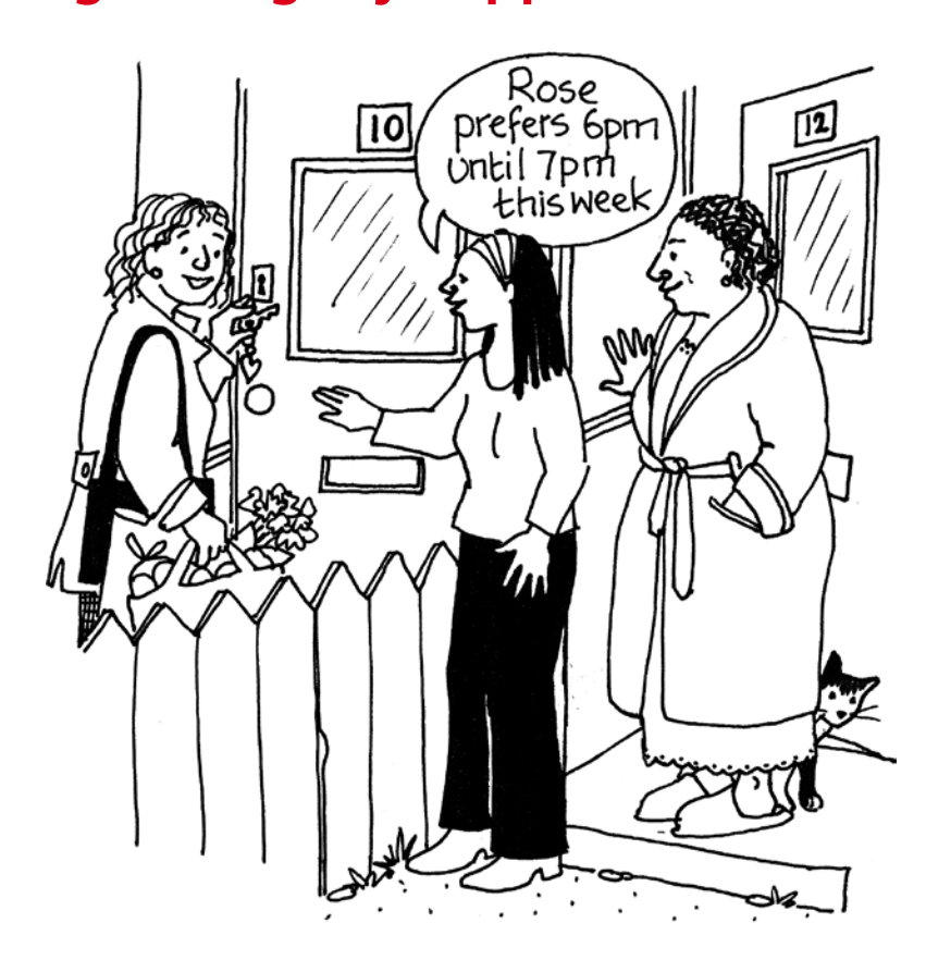
I can choose how I get my support.