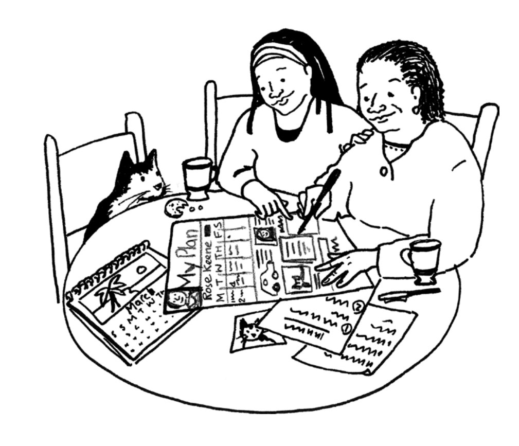
Who else can we get to help us do this plan?