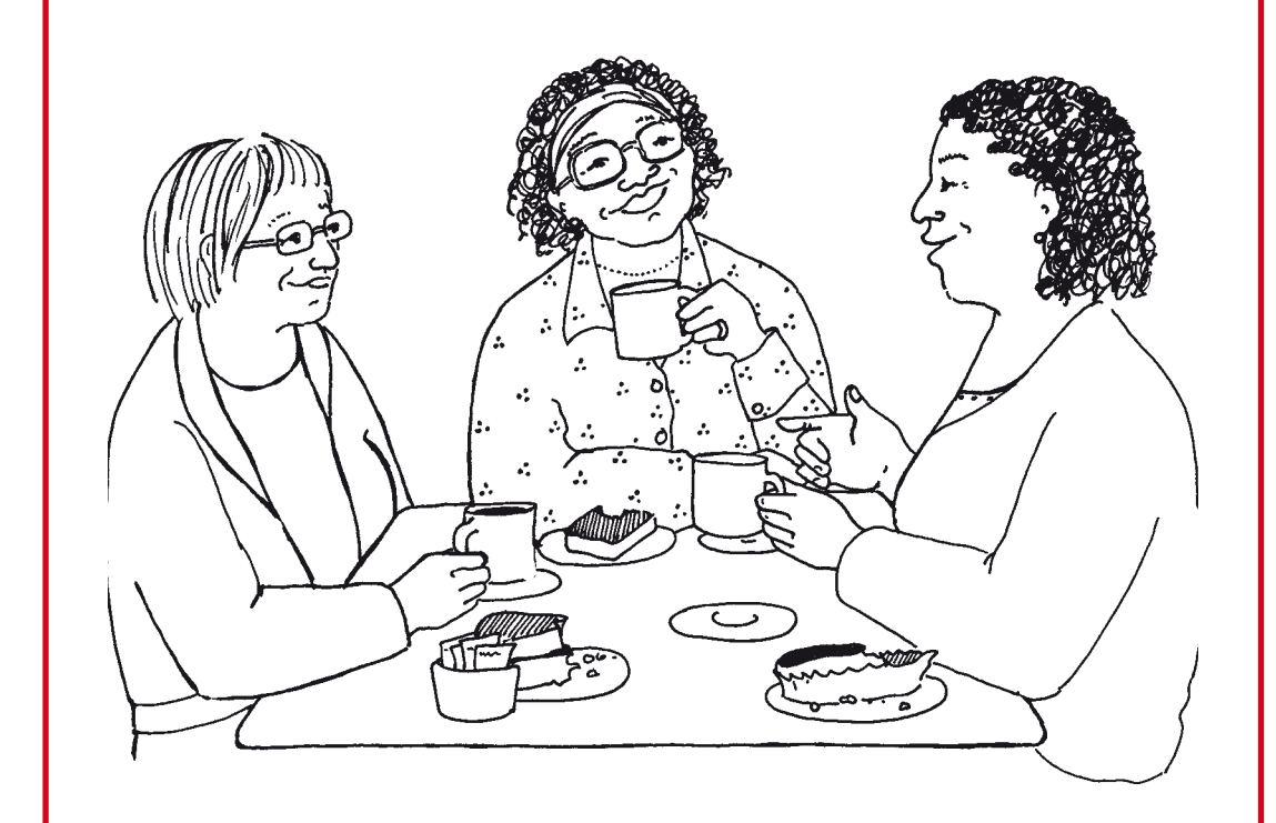
My life's changed – I'm in control.